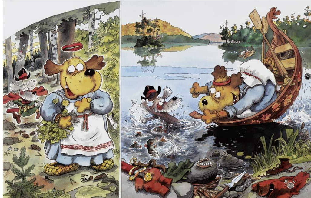
Canine version of Akseli Gallen-Kallela's Aino Triptych

Sources: (left) Turku Art Museum collection (right) Mauri Kunnas 1992. Koirien Kalevala (The Canine Kalevala) . Helsinki: Otava.