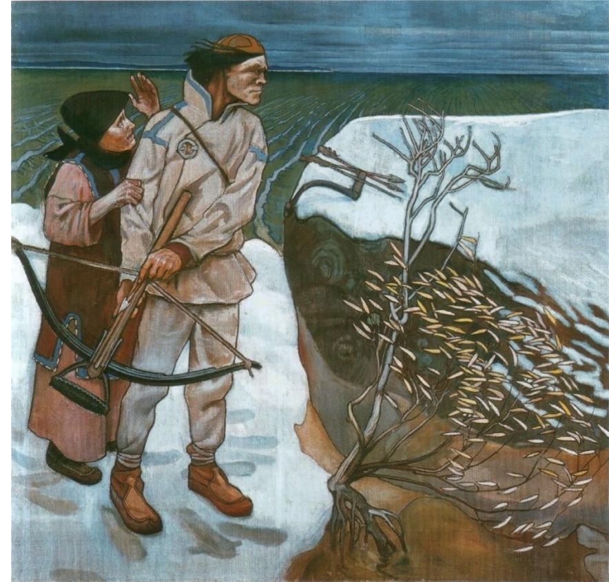
Akseli Gallen-Kallela: Joukahaisen kosto ( Joukahainen's Revenge ), 1897