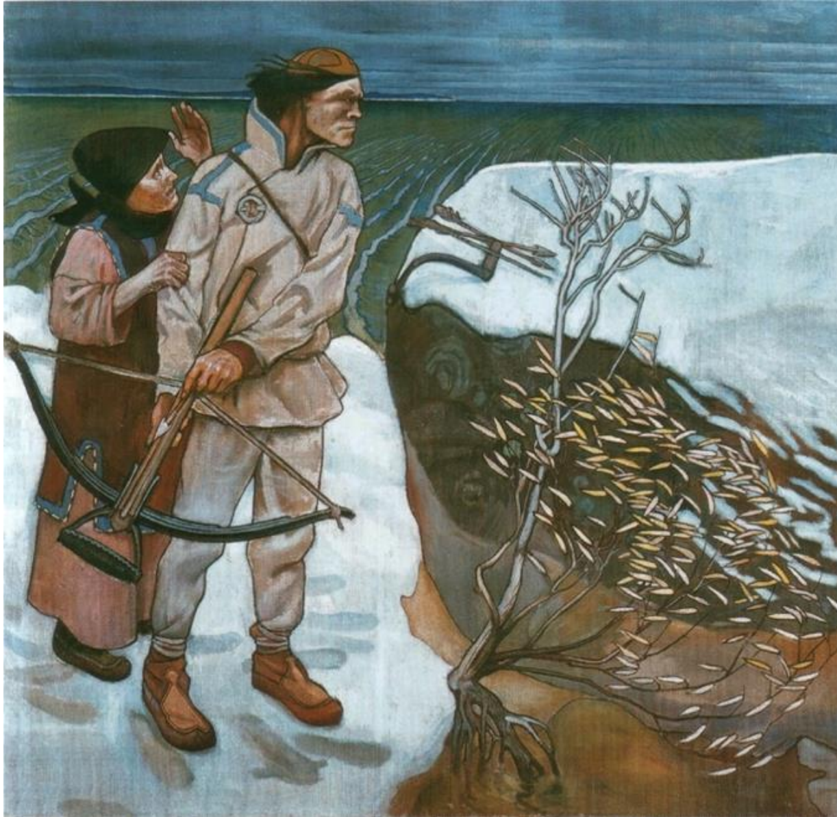
Akseli Gallen-Kallela: Joukahaisen kosto ( Joukahainen's Revenge ), 1897