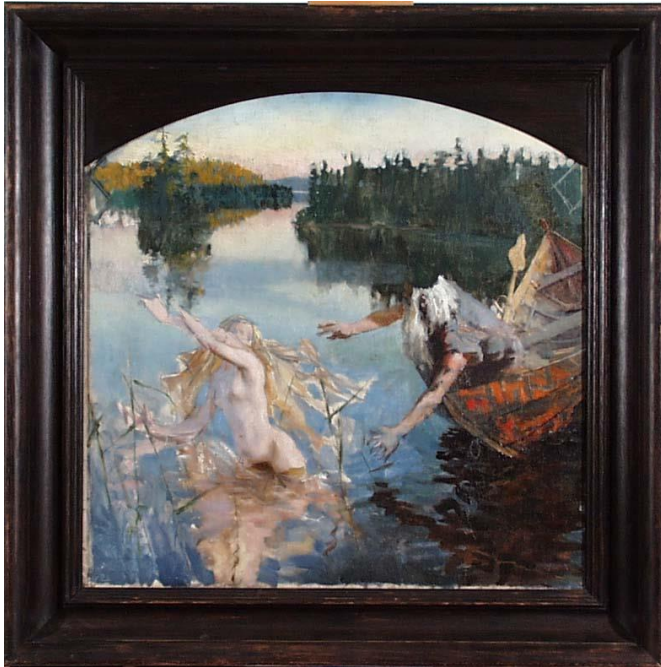
Akseli Gallen-Kallela: Sketch of the Aino myth , second panel of the Aino triptych 1891