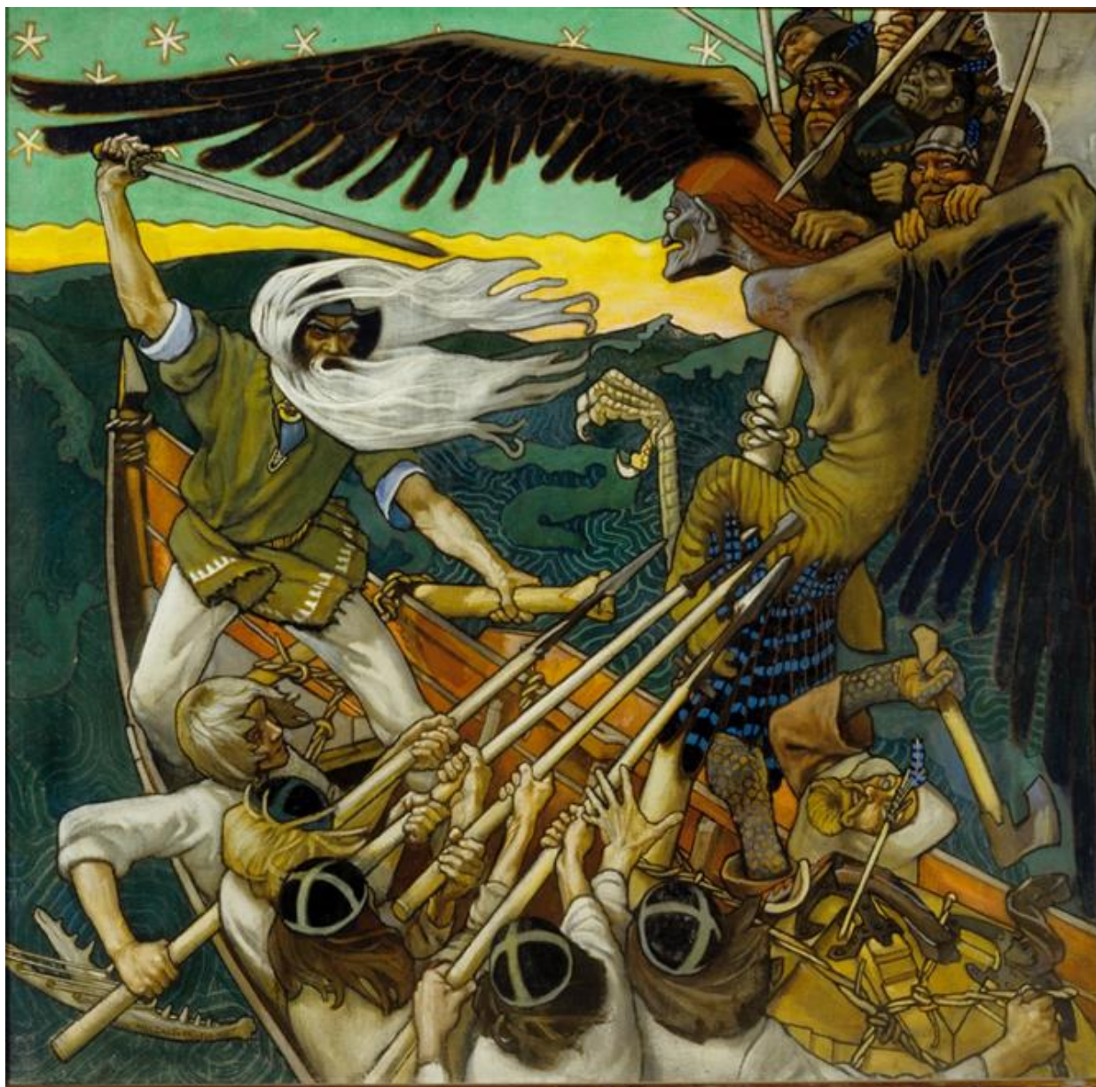
Akseli Gallen-Kallela: Sammon puolustus ( The Defense of the Sampo ), 1896