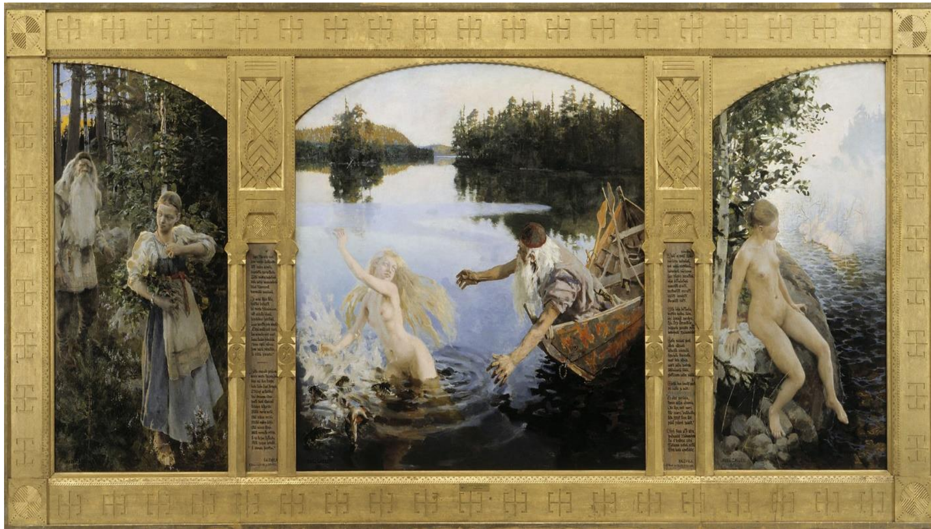
Akseli Gallen-Kallela: The Aino triptych 1891

https://fi.wikipedia.org/wiki/Aino-taru#/media/File:Gallen_Kallela_The_Aino_Triptych.jpg