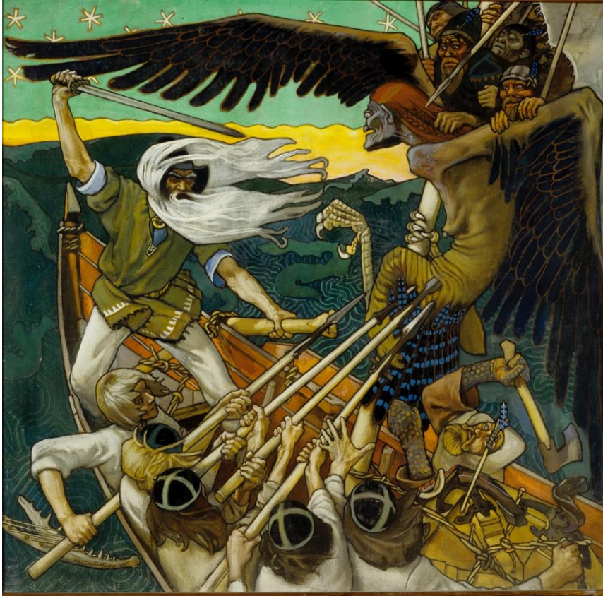
Akseli Gallen-Kallela: Sammon puolustus ( The Defense of the Sampo ), 1896